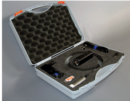
The Active-3 Torque Sensor Kit