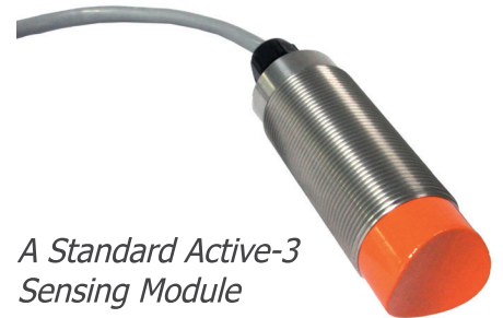
A Standard Active-3 Sensing Module

The Sensing Module of the Active-3 Torque Sensor is placed in a 30 mm diameter, industrial grade housing, and is designed for a specific Test-Object (shaft) diameter.