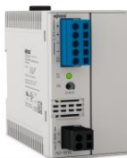
POWER SUPPLY 100-240V AC/24VDC 4A