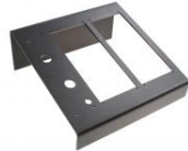
TRIPLE DESK STAND