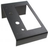
DUAL DESK STAND