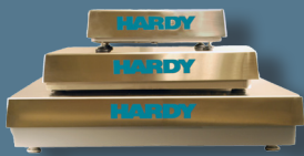
Hardy Bench Scales