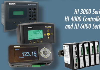
HI 3000 Series HI 4000 Controllers and HI 6000 Series