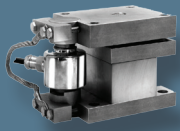
ADVANTAGE Series Load Point with C2 Calibration

Hardy carries a wide variety of strain gauge load points and scale bases to accommodate your application requirements.