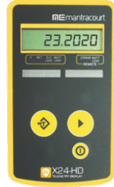
X24-HD ATEX Wireless display for connection to up to 24 load cells