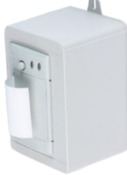
T24-PR1 Wireless surface mounting tally roll printer