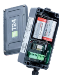
T24-AR Wireless range extender repeater module