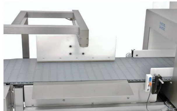
METAL SHARK BD with HQ Conveyor and Linear Pusher LP

Metal detector METAL SHARK® BD is used free-standing or combined with conveyor belts or chutes. Using 3D detection technology, it detects the smallest magnetic and non-magnetic metal contaminants (iron, stainless steel, aluminium etc.) precisely and reliably even under difficult conditions. The robust, closed stainless steel housing is easy to clean and therefore ideally suited to the food industry.