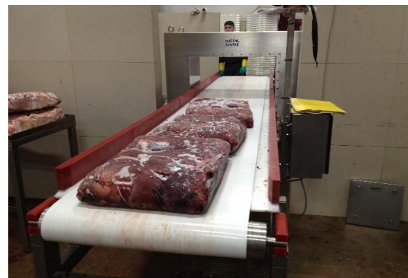
METAL SHARK BD with HQ conveyor for unpacked frozen meat blocks