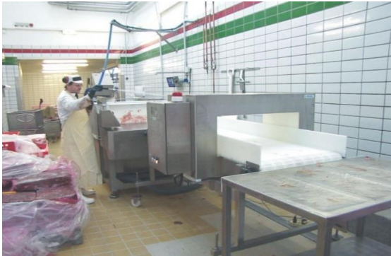
METAL SHARK BD with HQ Conveyor for meat