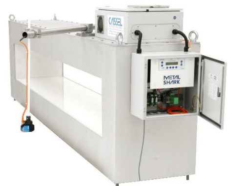
METAL SHARK BIG pba with Super Power Drive for more accurate metal detection plus belt seam detection to reduce false alarms