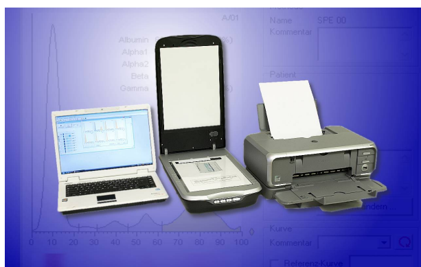
Universal electrophoresis densitometer TurboScan

The universal and flexible high-performance densitometer for your clinical laboratory.