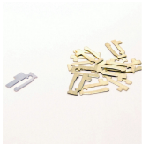
156T1950A Set of 12 Trippers for T1900, T2000, C8800, R8800 and T8800 Series