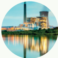
Industrial effluent treatment