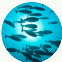
Sea water monitoring, fish farming, aquarium