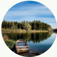
Surface water monitoring