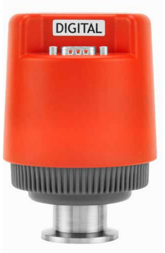
nAIM DIGITAL ACTIVE INVERTED MAGNETRON VACUUM GAUGE