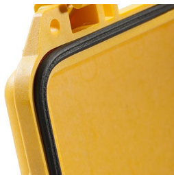
1753 Replacement O-ring