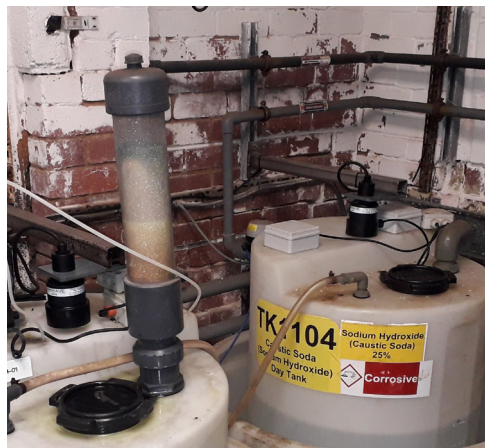
dBR8's reading through the plastic lid of a chemical tank.