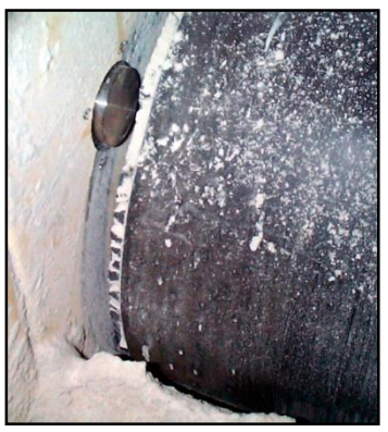
Enclosed Belt Conveyor Application