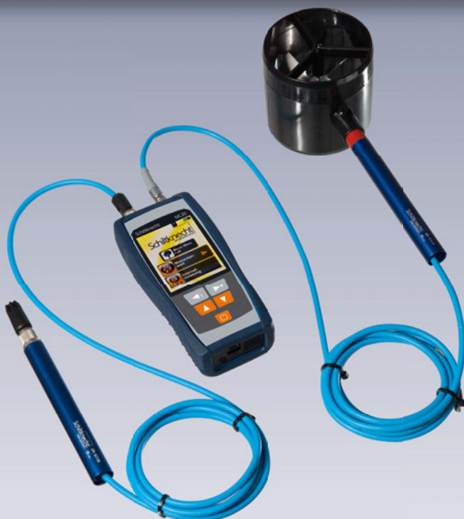
MiniController MC20 with MiniAir20 Macro (right) and HygroAir20 (left)

Schiltknecht Messtechnik GmbH Bachzimmerer Straße 37 D-78194 Immendingen Phone +49 (0)7462 947 94 20 Fax +49 (0)7462 947 94 21 http://www.schiltknecht.com Email: sales@schiltknecht.com