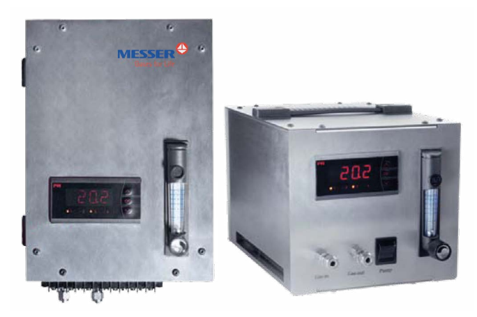
For wall mounting: Messer's oxygen sensor, ISM model, Portable oxygen sensor, POA model

The diagram shows that if, for example, a furnace space is inerted with N<sub>2</sub>(g), inerting must be made down to the oxygen level for point C before the combustible gas in question can be added. At this point, the combustible gas can be added in any concentration along the path C-S 100%, without risking uncontrolled combustion. When evacuating the furnace chamber of flammable atmosphere, the chamber must first be flushed from the current fuel mix to point B. Then it is safe to open the furnace chamber toward air and the gas mix will change along the line B-S-21% O<sub>2</sub>. Messer's oxygen sensor is an excellent tool for ensuring that the oxygen concentration is at a safe level before any flammable gas is added to the furnace space.