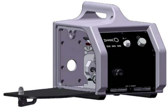
Model for supportive PUSH operation

Options according to range of application