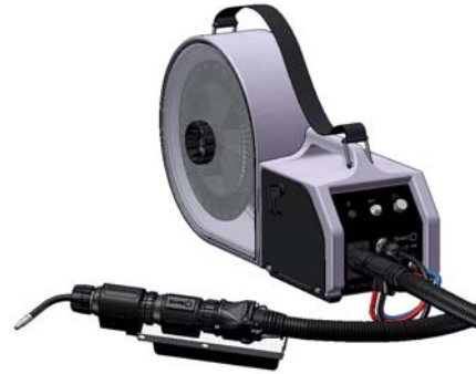
Model - Laser, MIG/MAG – with DIX WDS 200/300 (PUSH-PUSH operation)