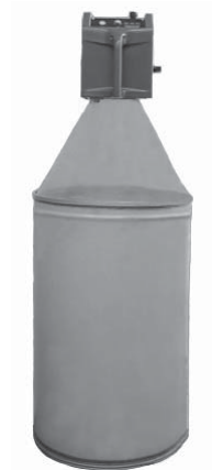
Model with wire barrel respectively for PUSH-PUSH operation