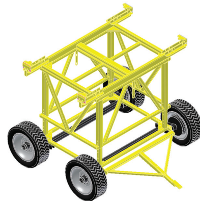
4 WHEEL TRAVEL DOLLY