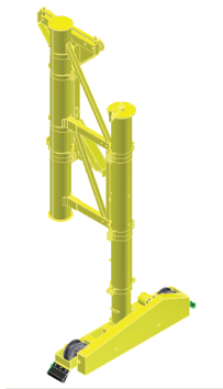
4 IN / 10 CM SWING