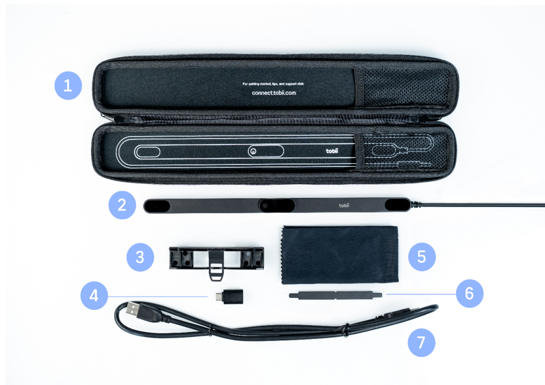
Figure 1. Tobii Pro Spark box and included items

Tobii Pro Spark ships with the following: