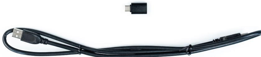
Figure 2. Tobii Pro Spark cable and adapter

If your computer has a USB Type-C interface, you can use the included USB Type-C male to Type-A female adapter.