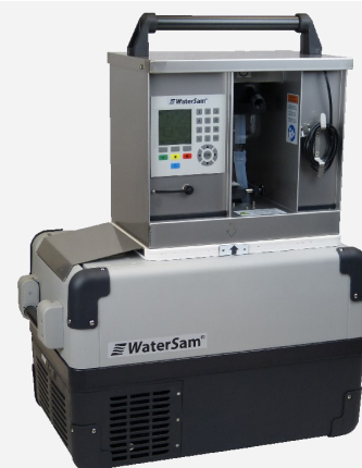
WS Porti 1T - 12T