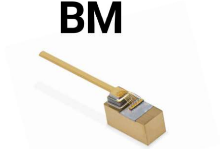
(BM) B-Mount BM-785-0150-XXX