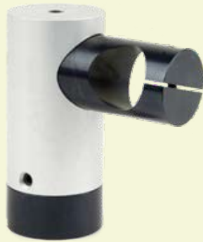
Heavy Duty Mounting Clamp

The heavy duty mounting clamp allows the GuideLine 2 to be securely fixed at any required direction or angle. The base plate has a series of threaded holes which allows the clamp to be fixed directly onto a machine or workbench. This can be purchased directly from RS Components, the product number is RS127-1551.