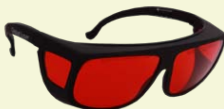
Red Laser Enhancement Glasses

To compliment our wide range of alignment laser diode modules we have introduced a range of Laser Enhancement Glasses which enhance projections in the red wavelength range (630nm to 670nm) by blocking light in other wavelengths, thus improving the visibility in outdoors or bright lighting conditions. The glasses also meet ANSI Z87 impact standard. This can be purchased directly from RS Components, the product number is RS127-1570.