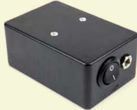
Battery Box Power Supply