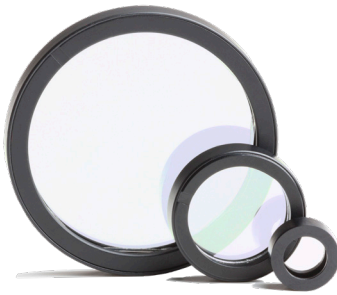
UBB Polarizers (mounting optional)