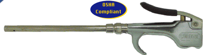
Safety Extension Tip 606-S