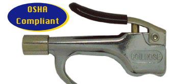
Tamper Proof 600-ST-DL