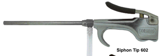
Siphon Tip 602