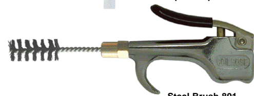
Steel Brush 801