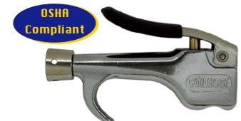
Safety Shield 600-SS