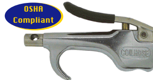
Safety (Standard) 600S-DL