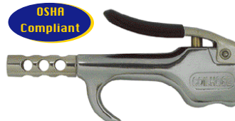
Safety Booster 600-SB