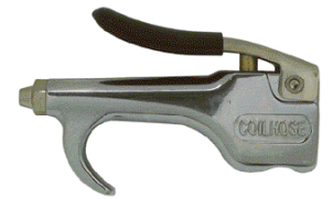
Brass Tip 605