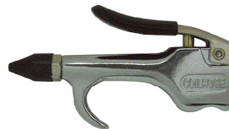
Rubber Tip 601