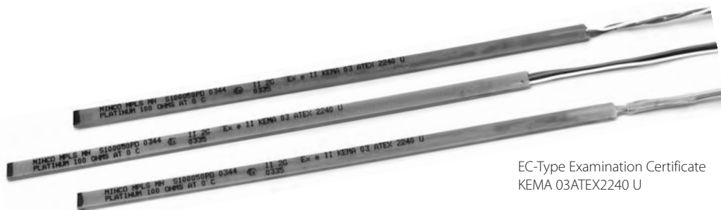
EC-Type Examination Certificate KEMA 03ATEX2240 U