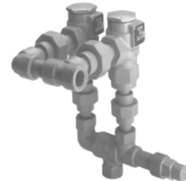
Dual Union Kit

To Order: Add "D" suffix for Dual Kit or "DU" suffix for Dual Union Kit to pressure-relief valve catalog number. Specify inlet/outlet connection size and pressure setting.