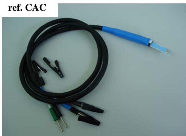
Figure 3. Cable connector for screen printed electrodes