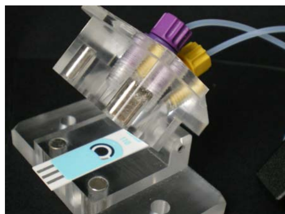
Figure 4. Flow -cell for screen printed electrodes