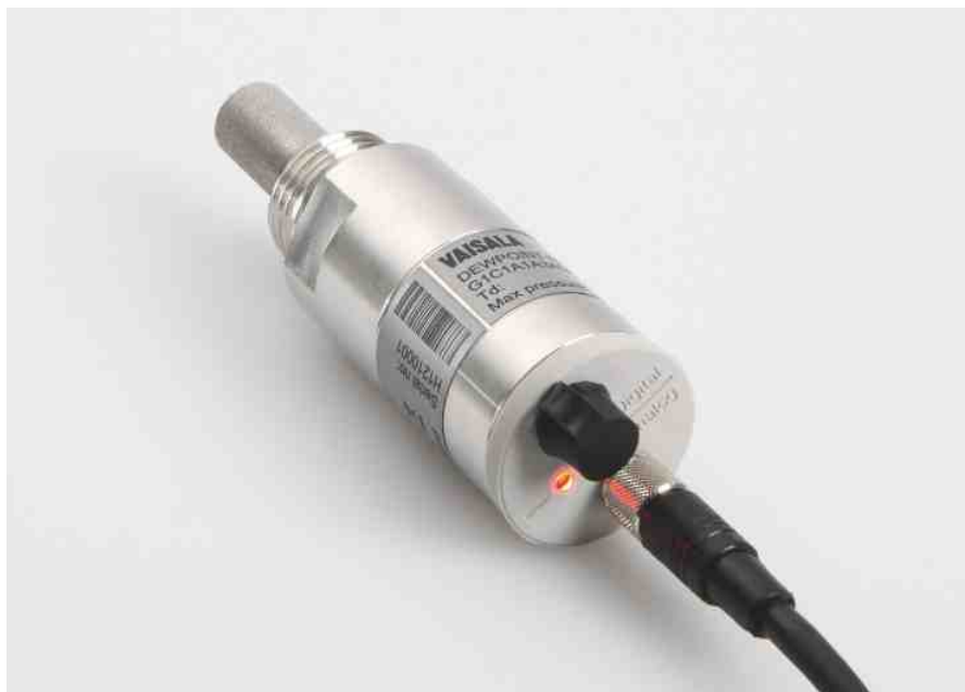
The Vaisala DRYCAP® Dewpoint Transmitter DMT143 is an ideal choice for small compressed air dryers, plastic dryers and other OEM applications.