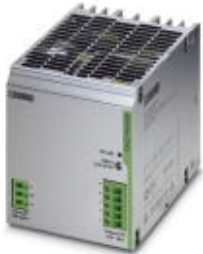
Primary-switched TRIO POWER power supply for DIN rail mounting, input: 1-phase, output: 24 V DC/20 A

Please be informed that the data shown in this PDF Document is generated from our Online Catalog. Please find the complete data in the user's documentation. Our General Terms of Use for Downloads are valid ( http://phoenixcontact.com/download )