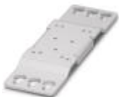
Universal wall adapter

Assembly adapters - UWA 182/52 - 2938235