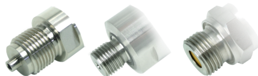
1/2" EN837 (manometer-coupling) 1/4" DIN3852 1/2" DIN3852 (quasi front-flush)